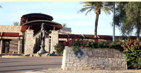
Wedgewood Ocotillo 3751 South Clubhouse Drive Chandler, AZ November 28, 2017

LODGING OPTION: Hilton Garden Inn Indianapolis South/Greenwood (317) 888-4814 Book by: July 18, 2017 Room Rate: $152.00 Mention Group Code: CRET